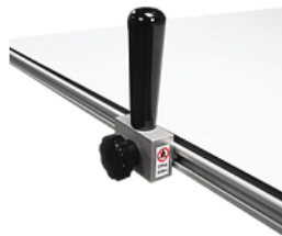
Table-side Patient Handgrips