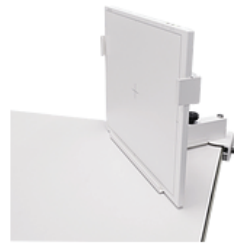
Lateral Cassette Holder